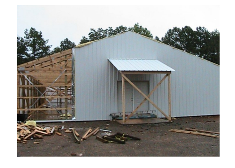
Recent Pictures of New Rum mage Sale Building